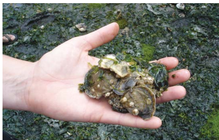
Fig. 4: A handful of O. conchaphila

In addition to genetic safeguards employed in both hatchery and natural seed production, it is important to avoid spreading diseases or invasive species during the course of restoration. For instance, to avoid spreading drills, mature oysters that are taken from areas with Japanese oyster drills should be cleaned of any obvious oyster drills and egg cases, and only re-distributed to similarly infested areas. Transfer permits are required by Washington state for all hatchery-produced seed. In addition, to avoid the spread of diseases health certifications are required for all seed introduced to a hatchery and subsequently distributed. As an added precaution, the cultch shell used as a settlement substrate in seeding projects should also be cleaned and stored on land long enough to ensure that there are no viable non-native organisms or disease organisms on the shell.