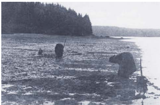
Fig. 1: Native Americans harvesting shellfish

Oysters are an integral part of North America's seafood supply, and have been since before European settlement. Archeological evidence and oral histories tell a story of subsistence and ceremonial harvest of oysters for most coastal Native Americans. On the West Coast, the gold rush in the mid-1800s fueled massive harvest and trade in the region's native oyster, Ostrea conchaphila (also Ostrea lurida ), and greatly diminished its distribution and abundance. However, the native oyster is making a comeback, and the story is far from over. This edition of Habitat Connections is the 3rd in a series on oyster restoration in the United States, and it focuses on the 'Olympia' oyster, the only oyster native to the U.S. West Coast.