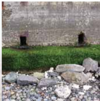
A green algae seep full of nutrients

If you think nutrients may be running off your property into the water, look for green algae trails on your beach, leading from bulkhead weeps or freshwater seeps. Though they may not come from the fertilizer you use, green algae trails do indicate a presence of excessive nutrients running from the land into the sea. The trails could also originate from septic systems, pet waste or other sources and carry pathogens. Check out all green seeps and trace them back to their source.