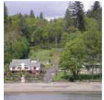
Trees and shrubs filter runoff.

These marine shoreline shrubs work in companion with trees to help bind the soil and capture rainwater: Bald Hip, Nootka and Clustered roses; Beaked Hazelnut; Ocean Spray; Pacific Ninebark; Red Twig Dogwood; Red Flowering Currant; Mock Orange; Serviceberry; Snowberry; and Vine Maple. These plants create thickets, can be pruned for more openness and are less likely to block views.