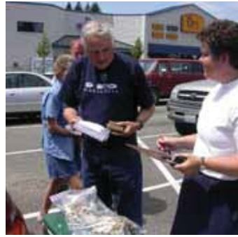
Submitting shellfish samples for testing

The state and counties generally do not assess private tideland water quality. Shoreline property owners may be able to infer the water quality of their tidelands based on state assessments of a nearby commercial operation or public beach. Another approach would be to sample your beach's shellfish and submit them to a lab for analysis. One test, however, will only be a snapshot of the water quality conditions on your beach on that day. The state and counties perform sampling over time and review a full set of data to make an assessment. Contamination levels can change with property use, weather and season. Do not harvest and eat shellfish if there are any doubts about their safety.