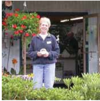
Select the right plants for your shoreline

What products do you use on the lawn or in your garden to keep it growing and free of weeds and pests? Are those products being picked up by the rain or the water from your sprinkler and running off onto your beach? If they are, the shellfish are filtering it and perhaps concentrating those compounds in their bodies.