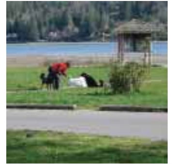
Scoop your pet poop

How you handle pet poop in your yard is important. Dogs, cats, chickens, birds, horses and other livestock all can contribute to fecal coliform pollution. Letting the rain wash away the poop in your yard is an easy way to make it disappear, but where does it go? Does it flow, with the water, down onto your shellfish? Remember, shellfish will be filtering those particles of poop as they pass by. When animals are allowed to make deposits on the beach, the feces liquefy and become shellfish and fish food. Yuck! Pick up your dog and cat waste, bag it, and put it into the trash, not into the septic system. For horses or other livestock, contact your local conservation district for manure management assistance. Horses for Clean Water also has an extensive Web site that can help you select the right kind of manure management system for your situation.