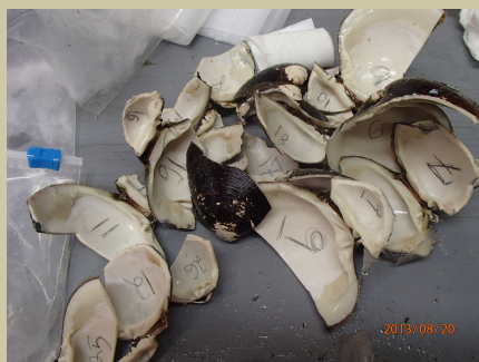
Broken hinge sections from ocean quahogs, NEFSC survey, August 2013.

Increasingly sophisticated models are used to estimate population size in support of quota setting. In these models, it is critical that the age demographic of the population be appropriately represented in the data from field sampling. Broken clams present a potential problem in this representation. If small (younger) clams are disproportionately broken and not included in the record, then data collection will depict a population that is older than the real situation. If larger (older) clams are disproportionately broken, then data will depict a population that is younger than the real situation.