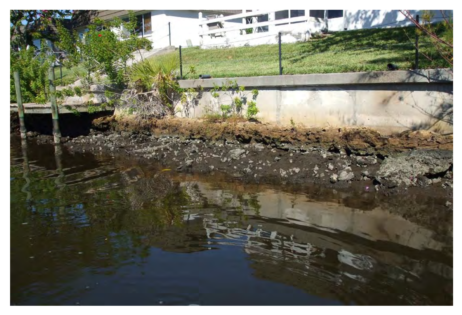
SCATTERED CLUMPS – SC AND SCATTERED SHELL - SS Clumps and shells are scattered in the mud along the base of the seawall