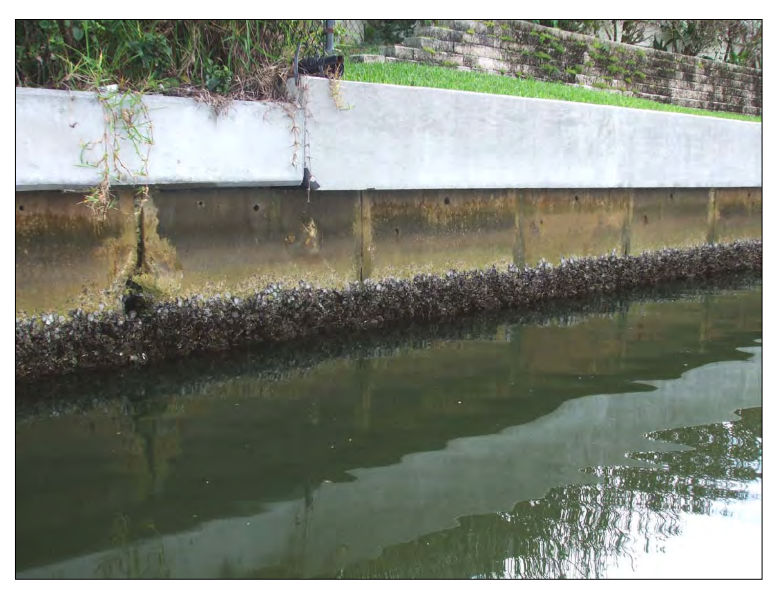
SEAWALL OYSTERS – SW-3 The oyster growth occurs in more than one layer thick in a band greater than 12" but less than 18" wide along the seawall