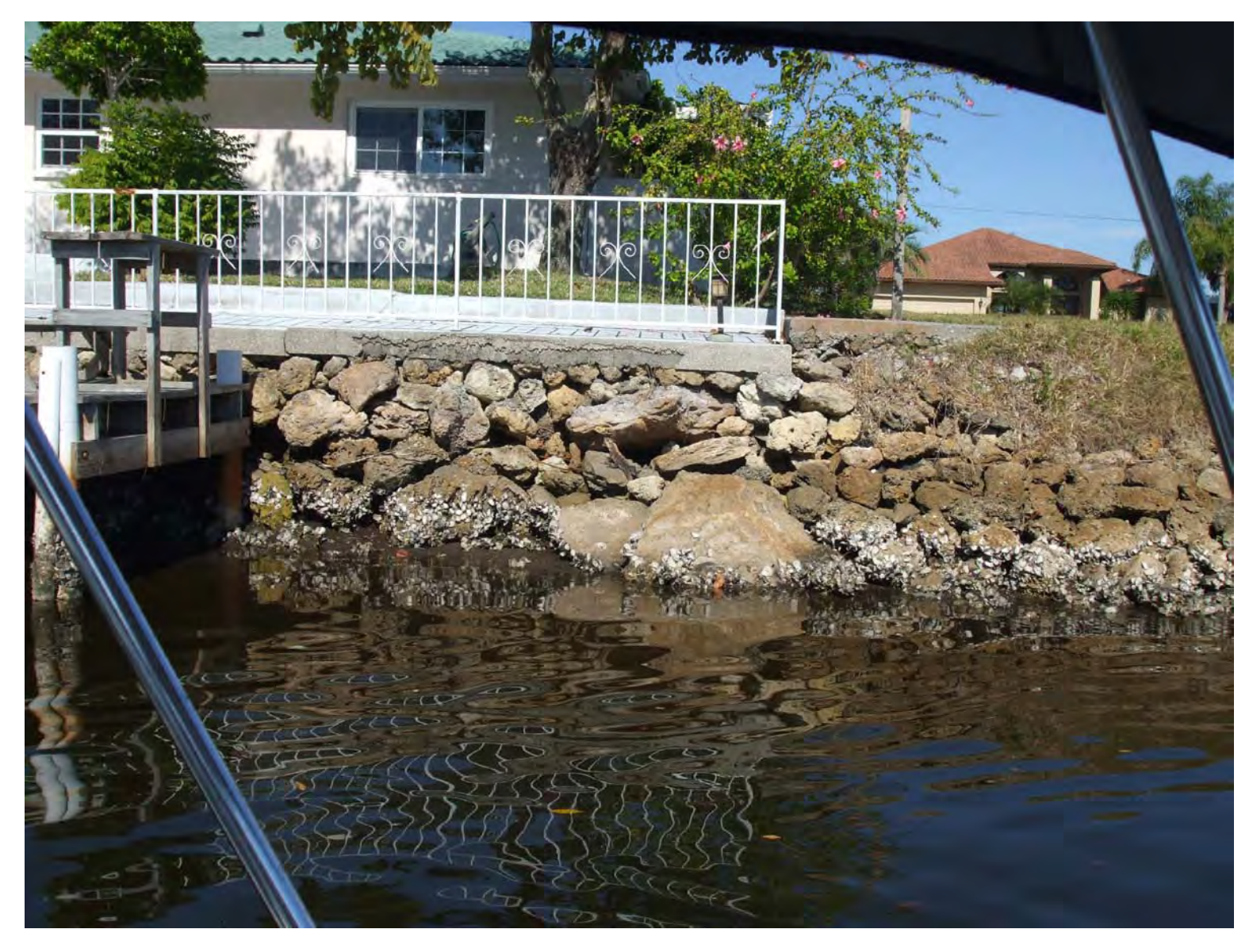
RIPRAP OYSTERS – RR-2 The oyster growth occurs in more than one layer in a band greater than 6" but less than 12" wide along the rocks.