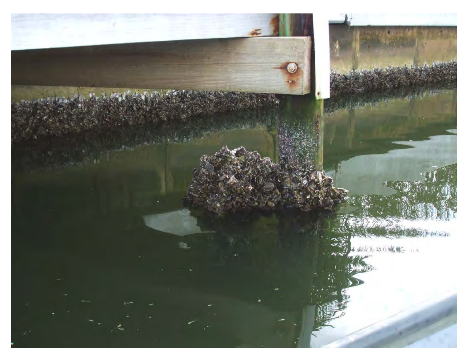
SEAWALL OYSTERS – SW-3 The oyster growth occurs in more than one layer thick in a band greater than 12" but less than 18" along the seawall. Clumps of oysters grow on pilings