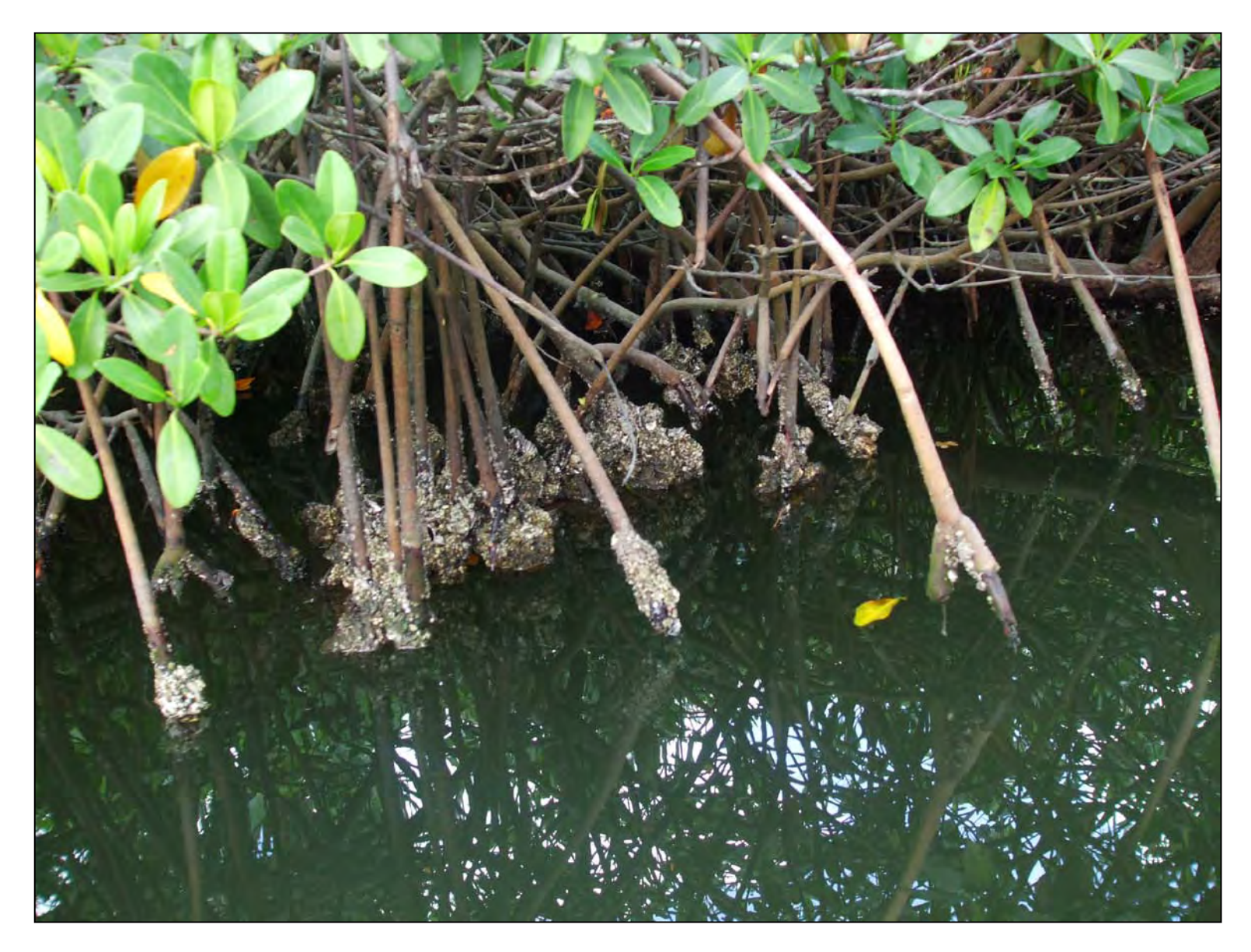
MANGROVE ROOT OYSTERS - MRO The oysters are growing on the roots of the Mangrove.