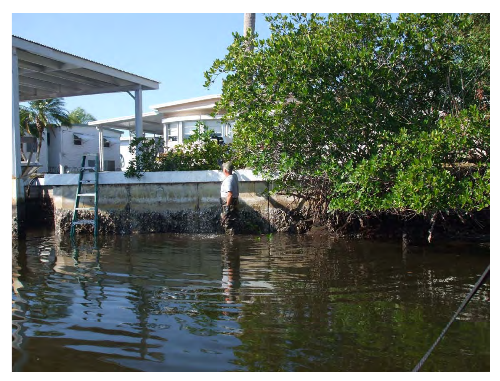
SEAWALL OYSTERS – SW-4 The oyster growth occurs more than one layer thick and in a band greater than 18" wide along the seawall