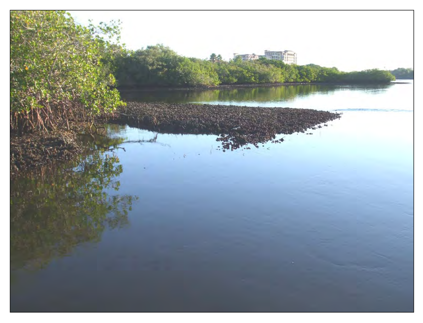
OYSTER REEF - R The reef is extending out from the mainland