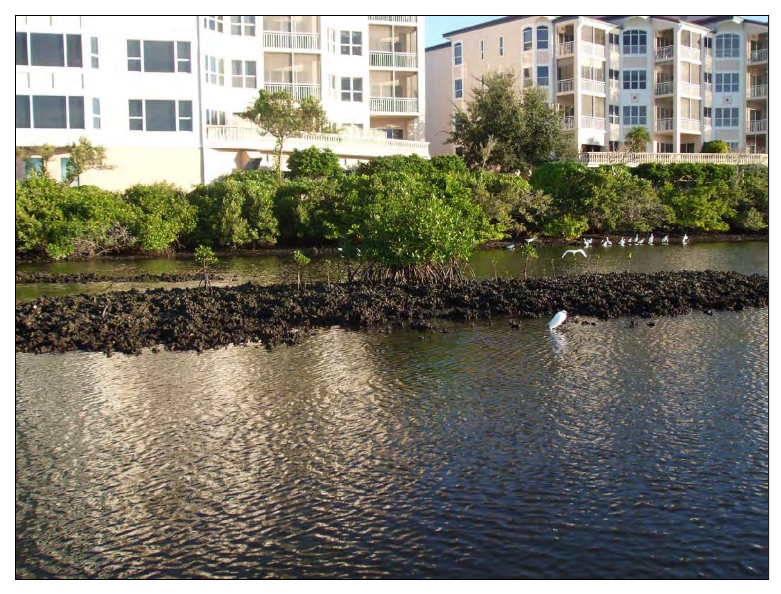
OYSTER REEF – R The reef is detached from the mainland. Mangroves are growing out of the oyster reef