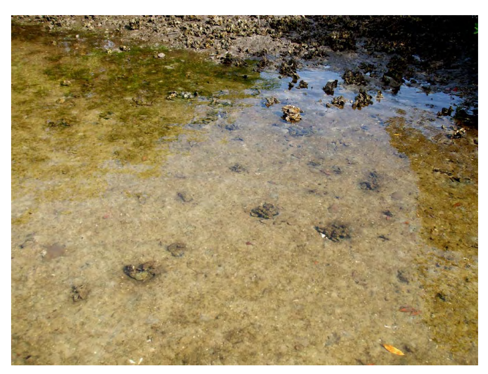
SCATTERED SHELL Shells are scattered along the shoreline and in the water