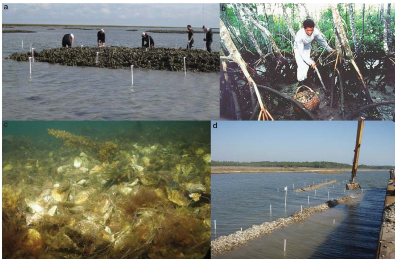
Figure 3. Oyster ecosystem services. (a) Light sensors deployed at low tide to measure filtration and changes in water clarity over a restored oyster reef in Virginia. (b) Oysters being gathered in a mangrove forest in Brazil. (c) Oyster reef restoration in progress to measure shoreline protection in Alabama. (d) Habitat provided by the Australian flat oyster in Tasmania, Australia.

and sport fisheries (e.g., Lipton 2004). Although there is increasing recognition that shellfish provide multiple ecosystem services, management for objectives beyond harvest has not yet become widespread.