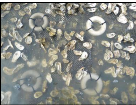
Oyster mats recently anchored in the lagoon with sprinkler weights

A project representative will bring all materials and give a presentation to your group about oysters reefs, the lagoon environment and instructions on how to create oyster mats. Completed mats will later be placed in the lagoon as the building blocks for new oyster reefs.