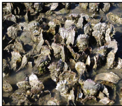
Oyster mats covered with live oysters after just seven months in the water