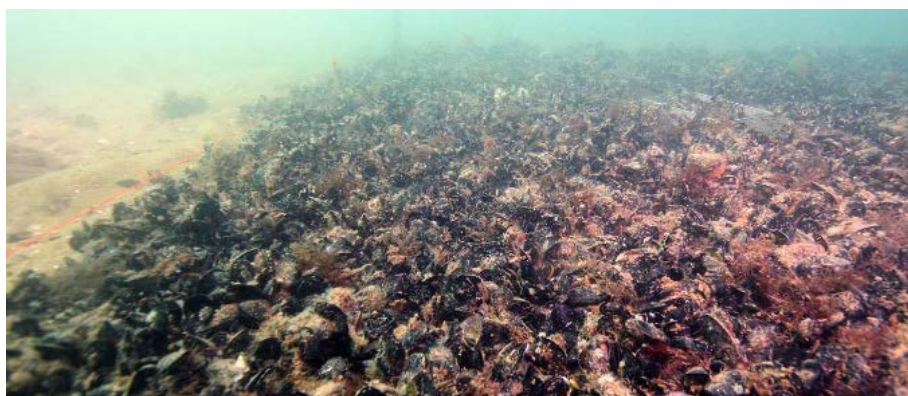
Mussel bed restoration plots in Port Phillip Bay.