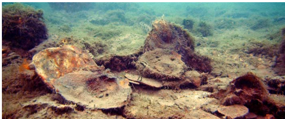
Old dead oyster reef at Geelong, Victoria.

A business case that demonstrates the value of repair will be developed to engender investment in rejuvenating damaged and sometimes now tidally isolated saltmarshes so they once again can produce prawns and other key components of the marine food chain.